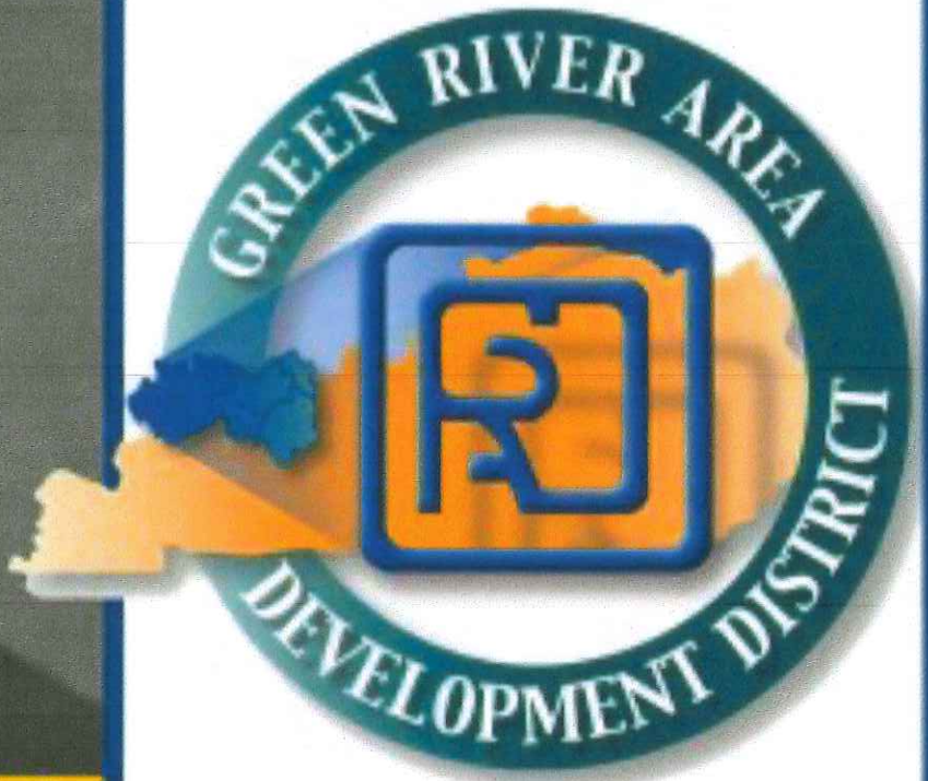
Charles Reid Regional Citizenship Award