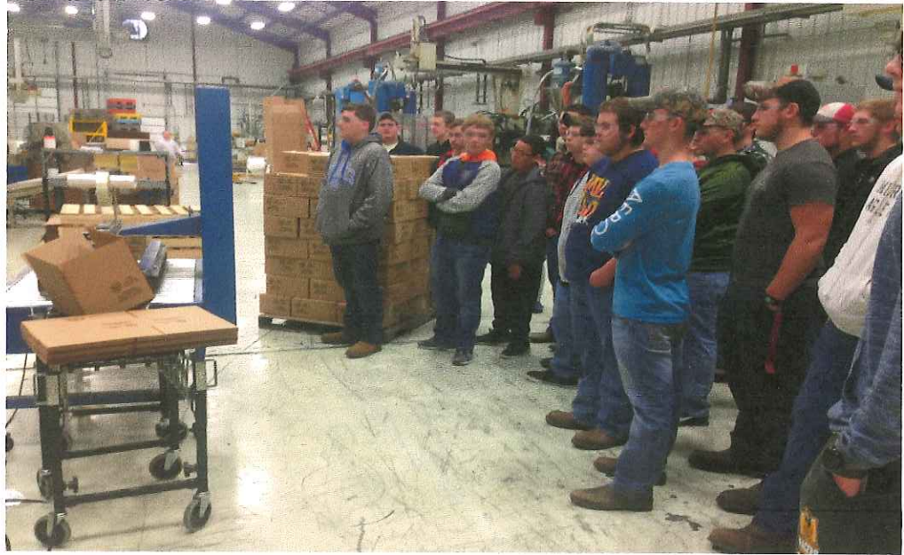
Webster Co. Manufacturing Day