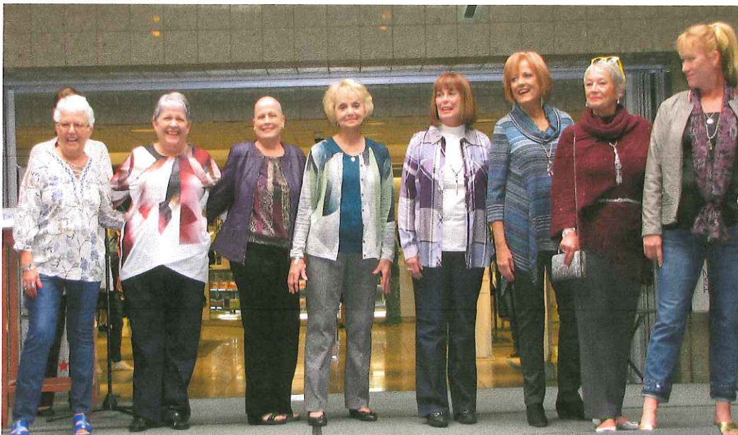
Senior Day at the Mall