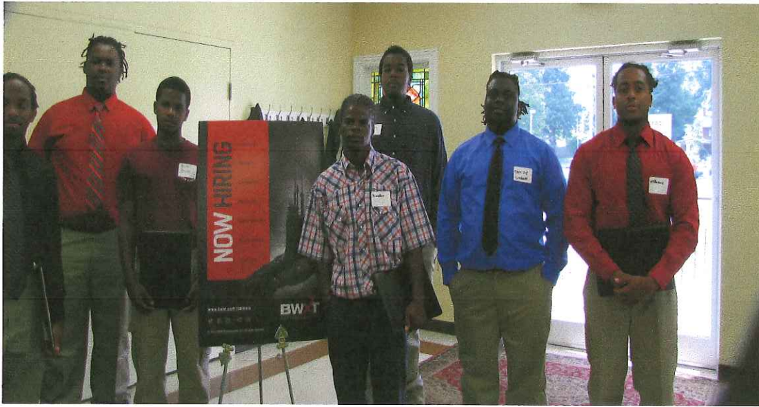
City of Morganfield Job Fair