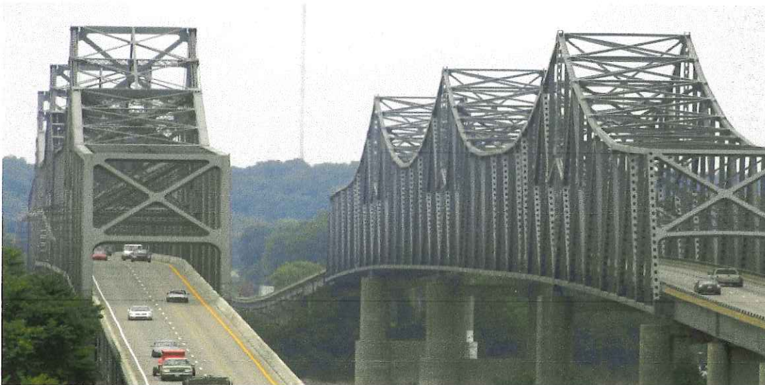
US 41 Twin Bridges

Local Road Update Program – Daviess, Hancock, McLean, Union, Webster