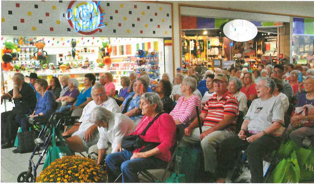
Senior Day at the Mall