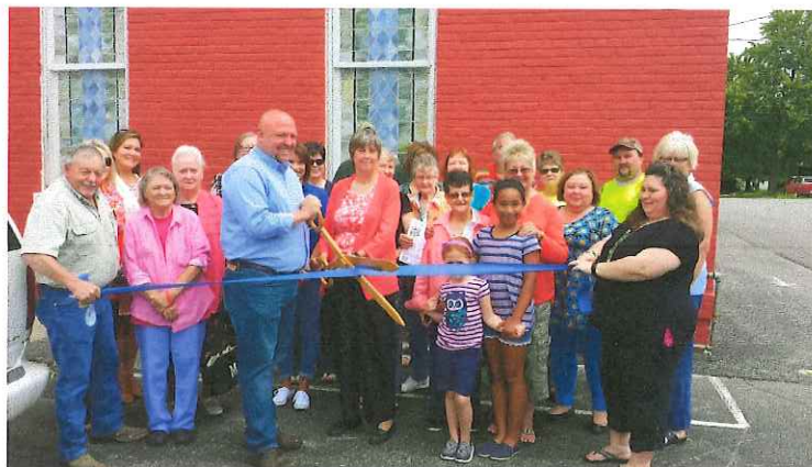
City of Sebree Senior Center Ribbon Cutting