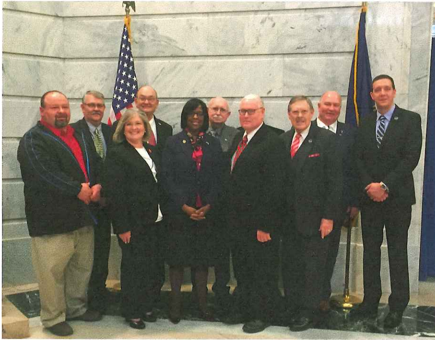
City of Hartford CDBG Announcement