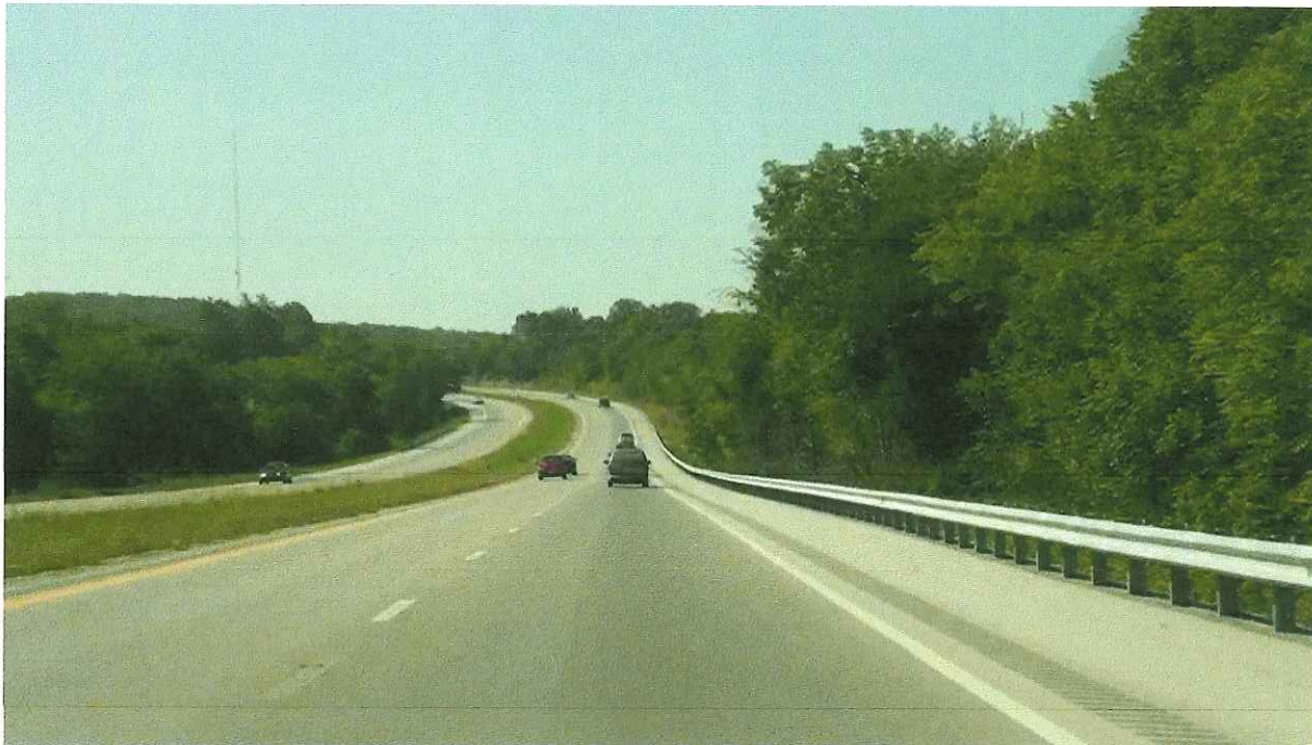
William Natcher Parkway