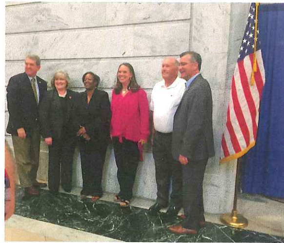
City of Corydon LWCF Award Announcement

Special Purpose Government Entity (SPGE) Technical Assistance Ohio County TIGER Grant Submission Daviss County Household Hazard Waste – KY Pride Hazardous Household Waste Grant Hancock County Hiring Practices Open Records Training Tax Rate Calculations for: Dixon, Sacramento, Island, Livermore, Beaver Dam, Corydon, Whitesville, Morganfield, Sturgis and Uniontown Demographic Research Daviss County Habitat for Humanity Assistance EDA Power Grant Submission for Henderson Community College